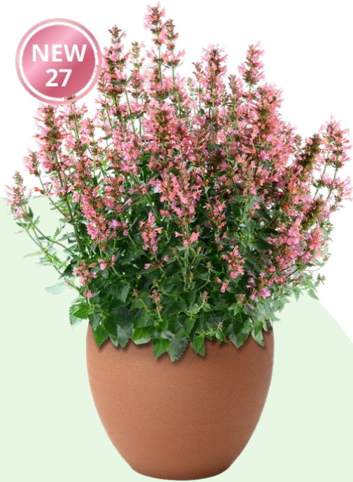
SUNNY SPARKS™ Coral