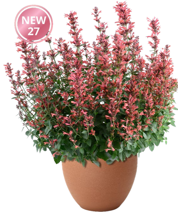
SUNNY SPARKS™ Punch