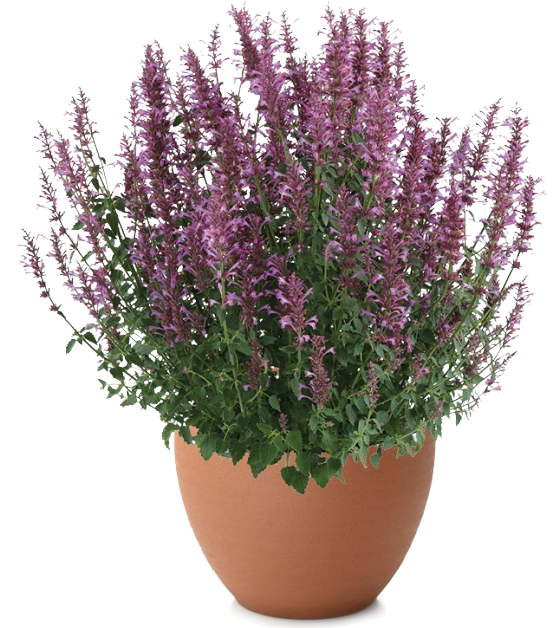
SUNNY SPARKS™ Pink Imp.