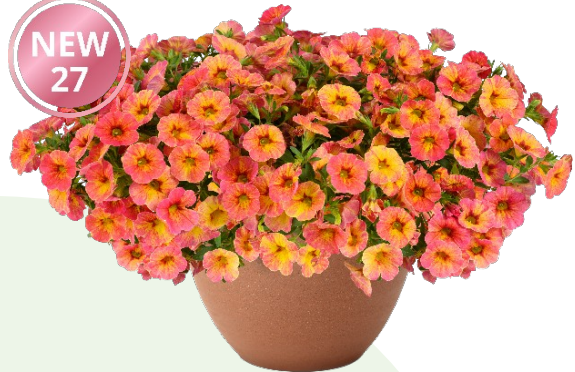
OMBRE™ Tyler Glam CA-22-2400