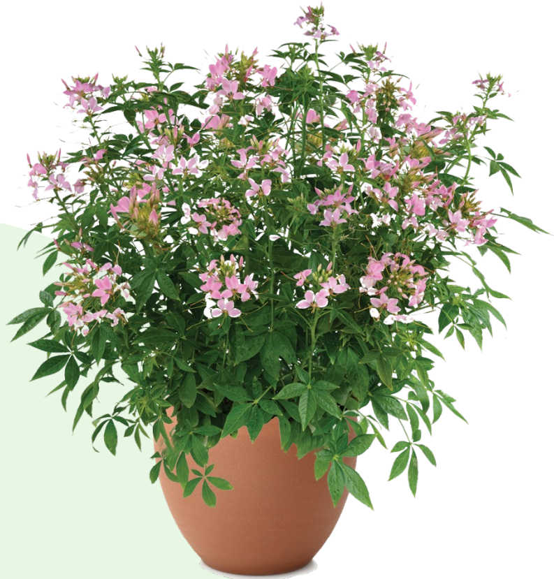
CLIO™ Pink Lady Imp.