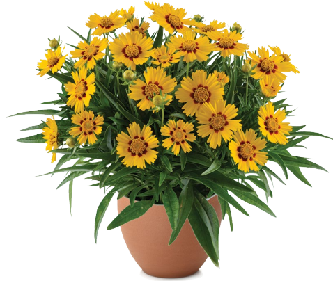
SOLANNA™ Bright Touch