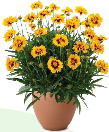
SOLANNA™ Sunset Bright