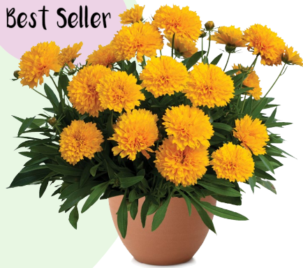
SOLANNA™ Golden Sphere