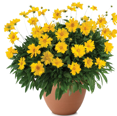
SOLANNA™ Sunset Burst