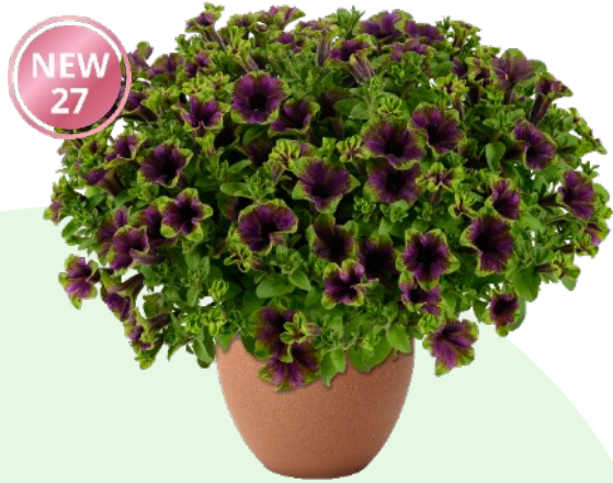
AMAZONAS™ Midnight Finch PE-23-4599