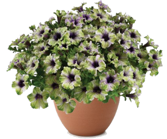
AMAZONAS™ Plum Cockatoo