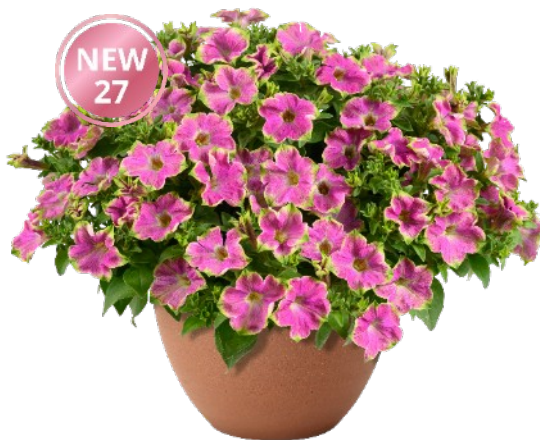
AMAZONAS™ Pink Macaw PE-23-4611