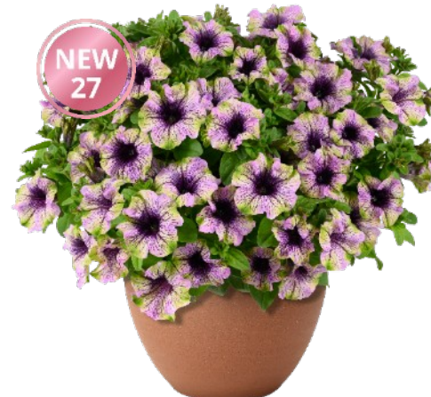
AMAZONAS™ Violet Parakeet PE-23-4435