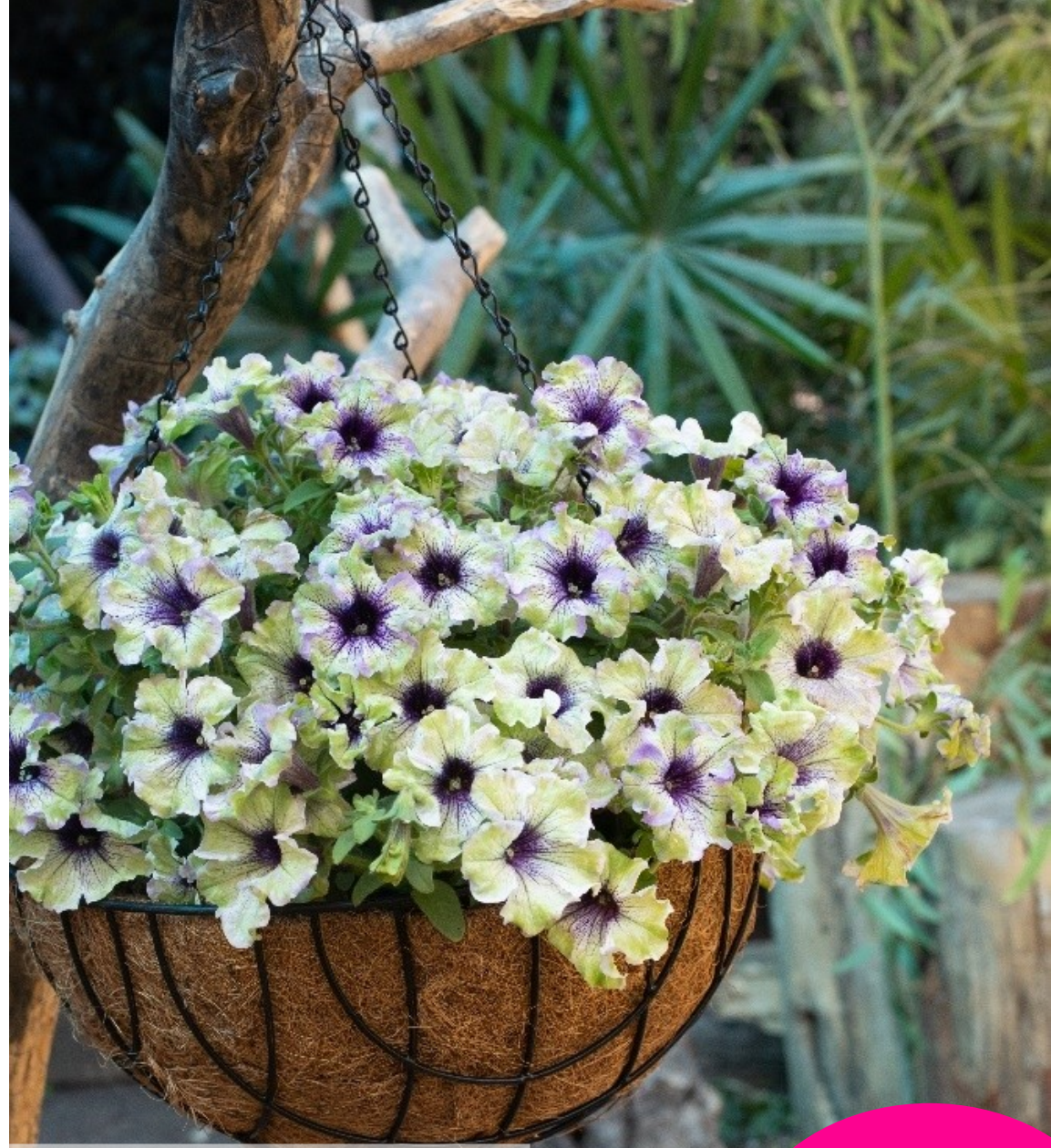
AMAZONAS™ Plum Cockatoo